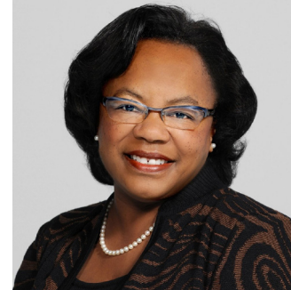
Sharon Sayles Belton